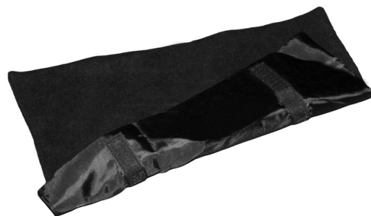
Fleece-Top Comfort Liner with Hook & Loop Fasteners.