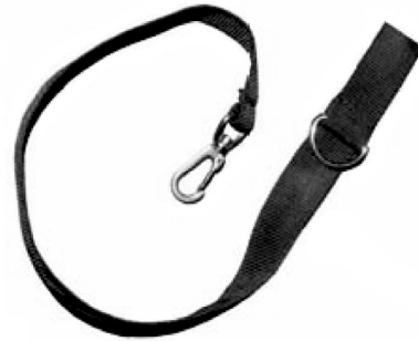
Tether and D-Ring. (This has been sewn into the interior of the unit.)